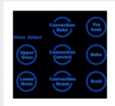
30" DOUBLE WALL OVEN E30EW85EPS