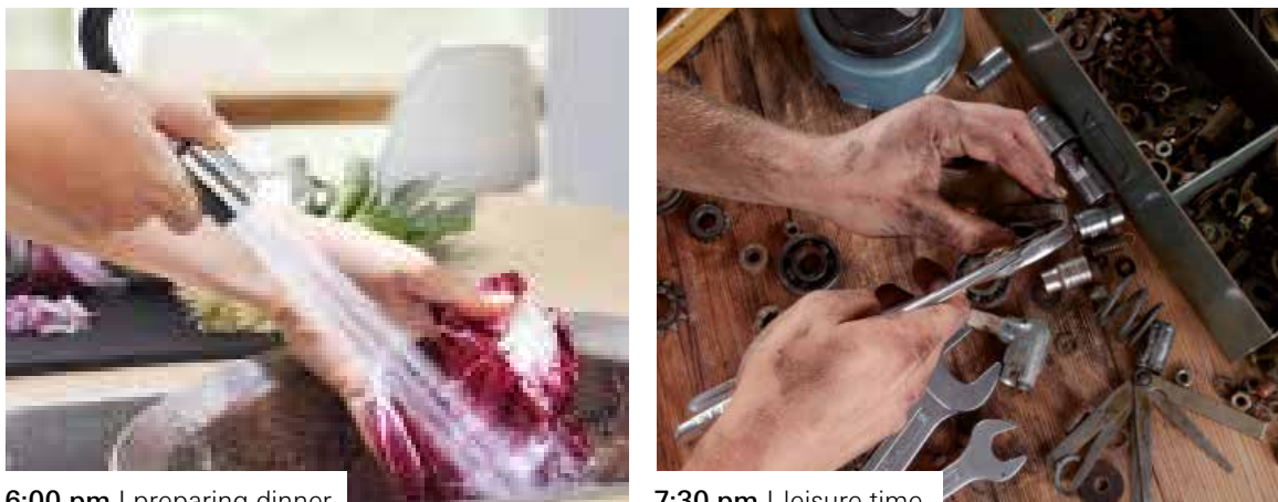
6:00 pm | preparing dinner