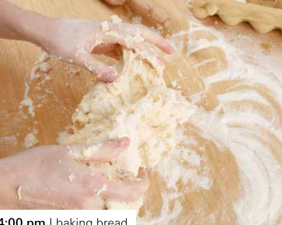
4:00 pm I baking bread