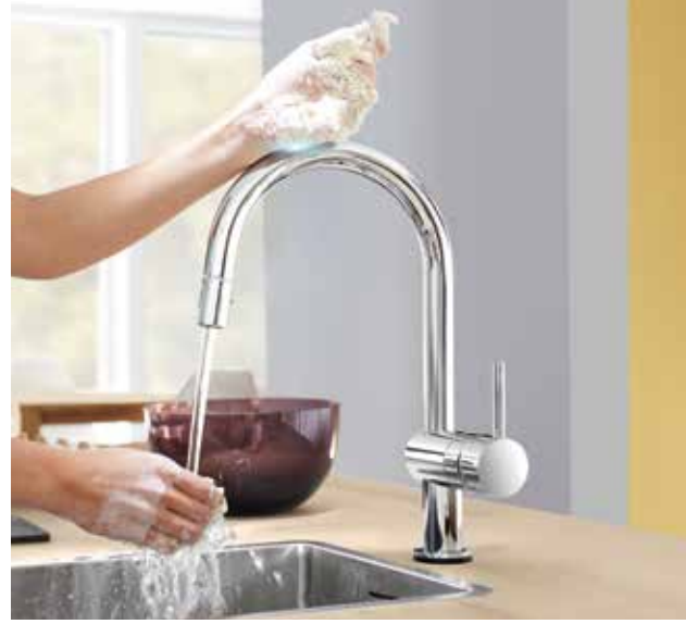
Just touch the faucet anywhere on the spout or body to turn water ON or OFF. EasyTouch function works even when the lever is manually in the OFF position.

Use the lever to precisely adjust water flow and temperature. The GROHE Minta Touch is simple, sensual, moving – a faucet that intelligently helps keep your kitchen looking beautiful.