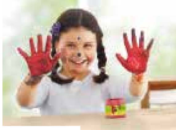
2:00 pm | messy play