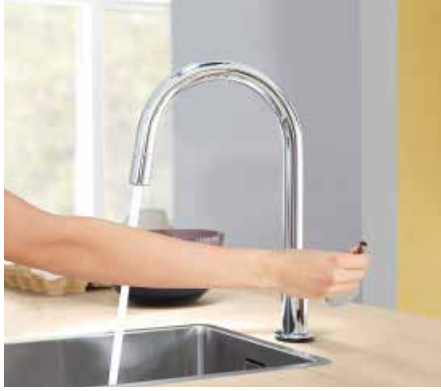
Use the lever to adjust temperature and water flow.