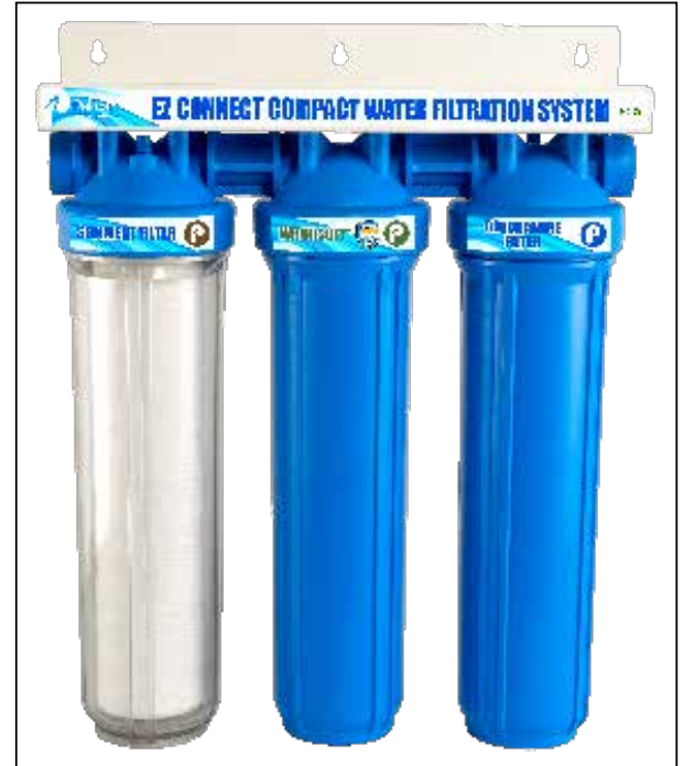
Front of Pelican EZ Connect PSE-500

If this or any other system is installed in a metal (conductive) plumbing system, i.e. copper or galvanized metal, the plastic components of the system will interrupt the continuity of the plumbing system. As a result any errant electricity from improperly grounded appliances downstream or potential galvanic activity in the plumbing system can no longer ground through contiguous metal plumbing. Some homes may have been built in accordance with building codes, which actually encouraged the grounding of electrical appliances through the plumbing system. Consequently, the installation of a bypass consisting of the same material as the existing plumbing, or a grounded "jumper wire" bridging the equipment and reestablishing the contiguous conductive nature of the plumbing system must be installed prior to your systems use.