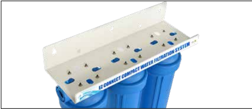
Top of Pelican EZ Connect PSE-500