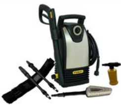
Electric Pressure Washer