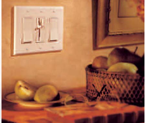
UL AND CUL LISTED RESIDENTIAL LIGHT COMMERCIAL