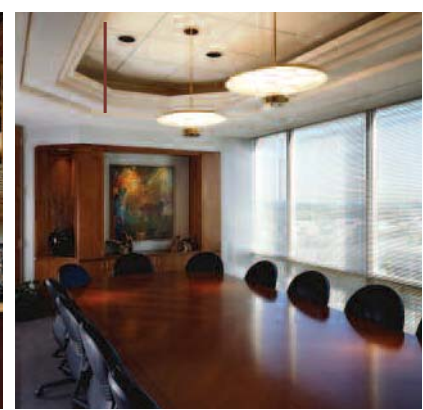
Quieter operation in any installation.