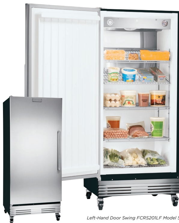
Left-Hand Door Swing FCRS201LF Model Shown

19.53 Cu. Ft. Commercial, Food Service Grade