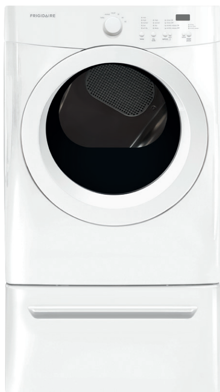
Optional SpaceWise® Pedestal Drawer Shown