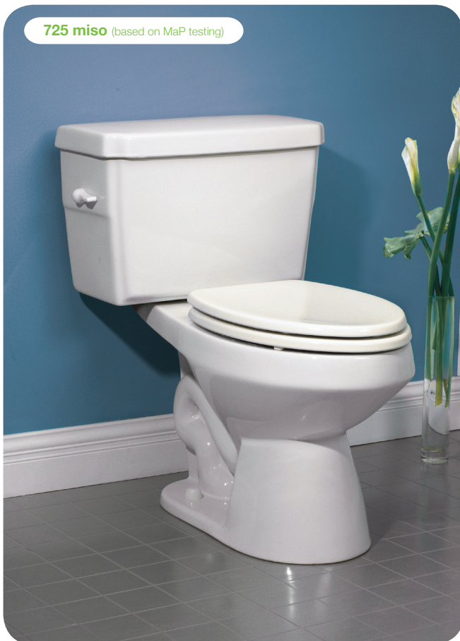
725 miso (based on MaP testing)