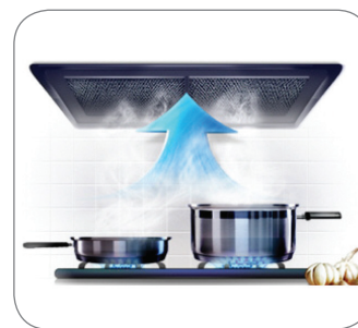
300 CFM Ventilation System