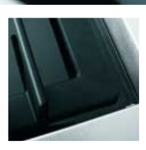
48" GAS SLIDE-IN COOKTOP E48GC76EPS professional series