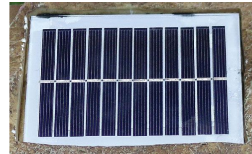
Solar Charging Panel

*Charge times may vary depending on solar conditions.