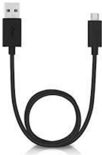
36" USB Charging Cable -1