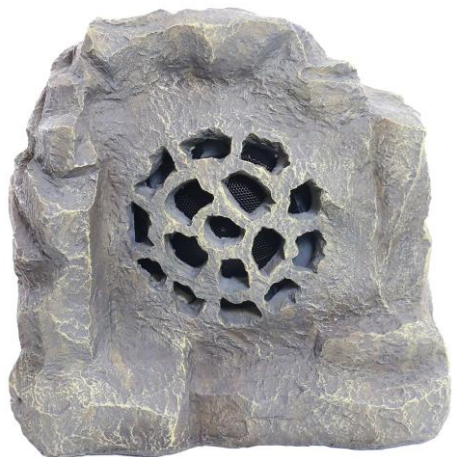
Solar Bluetooth Speaker -1