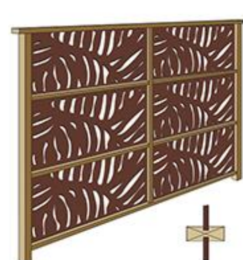
Window-Mount in Frame with Channel