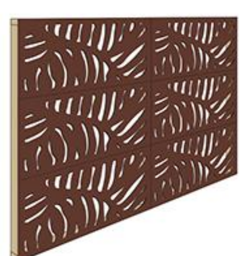
Face-Mount on Frame (Shown in photo above left)

Installation examples are recommended options. If in doubt, consult a professional.