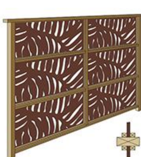
Window-Mount in Frame with Casing