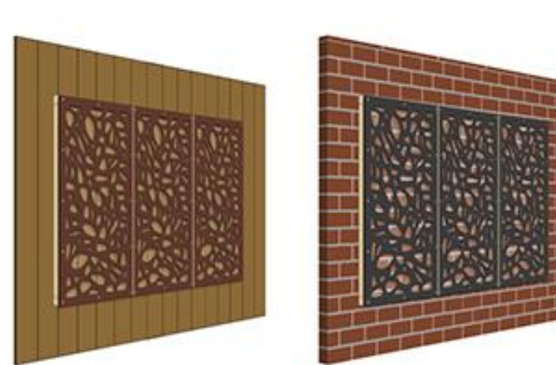
Face-Mount on Frame Installed on Fence or Wall

Install MODINEX Panels according to instructions or the warranty will be void. Find installation videos and instructions at modinexpatterns.com or by clicking the Instructions/Assembly link in the "Info & Guides" section above on this page.