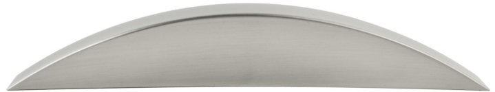
Satin Nickel - RL020630