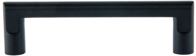
Matte Black - RL062104