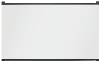
BFSL33DOOR - Single pane, tamperproof glass door Dimensions: 29-1/8" W x 18-1/4" H x 1/2" D (74.0 cm x 46.4 cm x 1.3 cm)