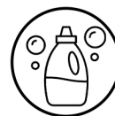
CLEAN SINK WITH MILD ABRASIVE