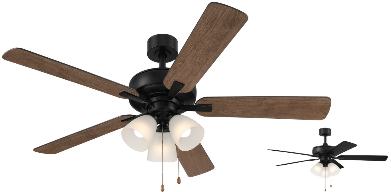
FP-STL52B30-MB Matte Black finish with Sepia Brown blade finish | Inset: Matte Black blade finish