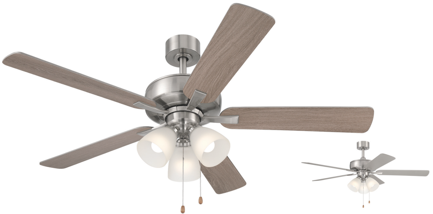
FP-STL52B30-BN Brushed Nickel finish with Pearl Gray blade finish | Inset: Silver blade finish