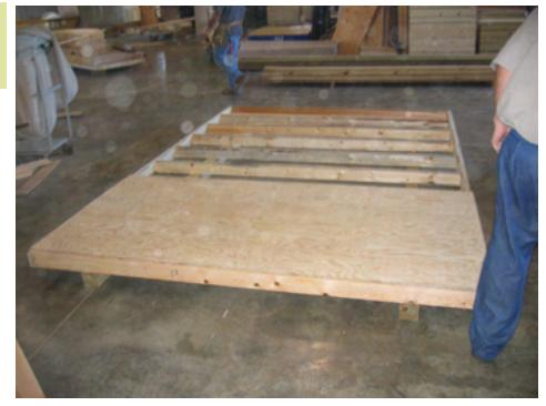
Install 5/8 CDX as shown.