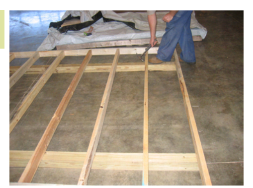
Continue fastening joist with 3" nails into 4x4's as shown.