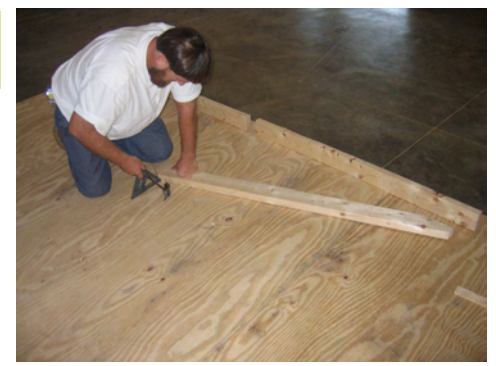
Fasten 2x4's as shown with 3" nails.