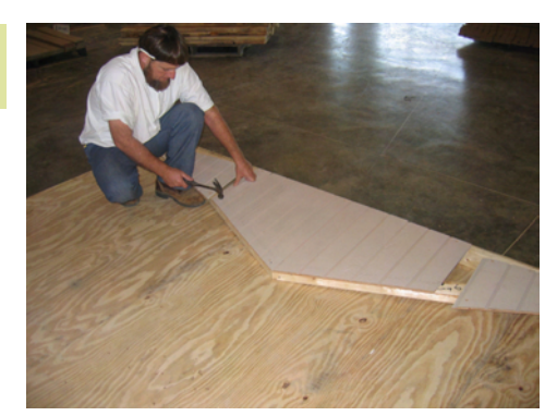
Continue fastening Smartside siding.