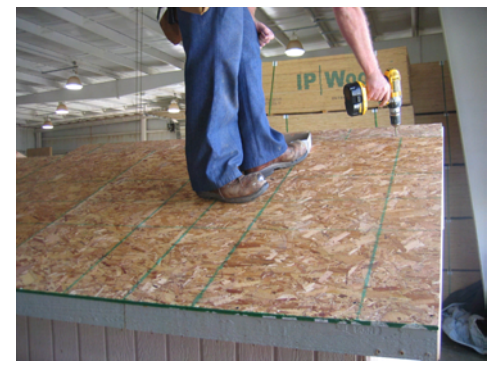
Fasten the OSB to the rake as shown. 6" overhang on gable end.