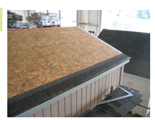
Install the drip edge around the edge of the building. You can see the white around the edge of the building. You can then install the shingle starter strips as shown. Refer to the shingle pack for additional instructions.