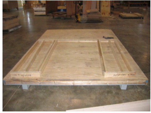
Locate the gable wall parts where the double door is.