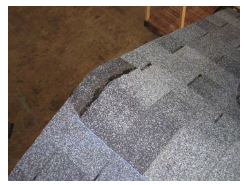
Cut the ridge cap to fit when you get to the end as shown.