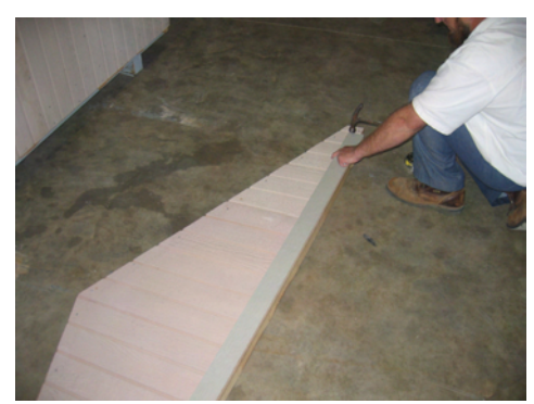
Nail every 6" to 8".