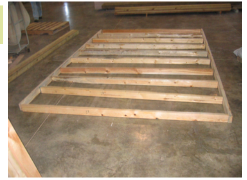
Locate your rim and floor joist and layout as shown.