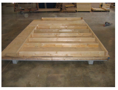
Locate 2x4's for wall and layout wall as shown.