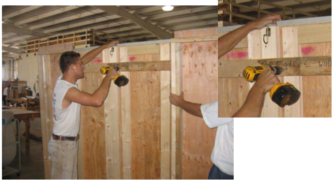
Next temporarily fasten the 2x4 into doors with one 2 1/2" screw.