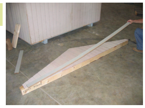
Install 2 3/4" trim as shown.