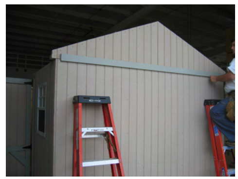
Next position the gable on top of the wall as shown.