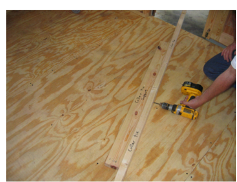
Use the door packing brace and fasten the wall braces together as shown.