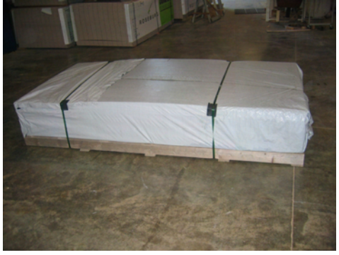
Thank you for purchasing from Little Cottage Co. You will find all components necessary to complete your storage shed. Refer to your buy list for specific contents which will vary by unit.