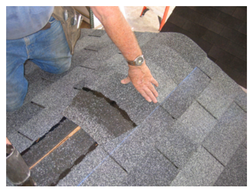
Continue capping off the roof.