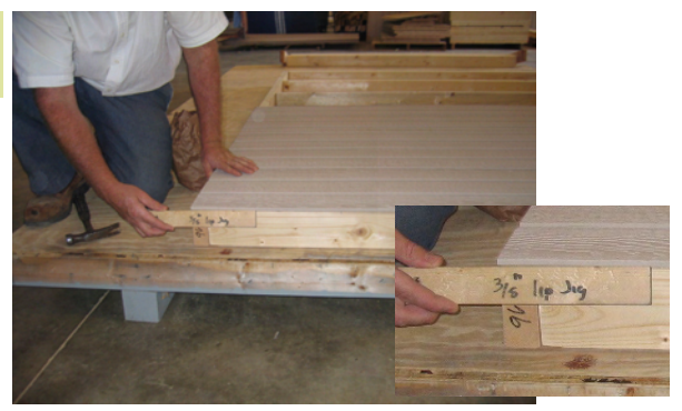
Next install siding as shown on the side and make sure the top & side are flush. Fasten with 2" nails.