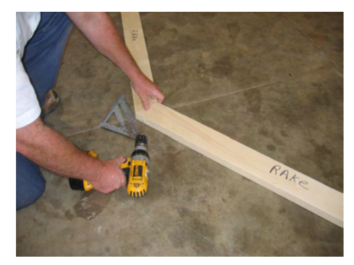
Fasten the rake together as shown. Keep even on the bottom and screw together.