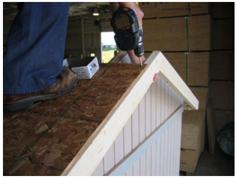
fasten the OSB to the rake.