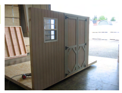
Install the wall as shown, per diagram and fasten with 3" nails.