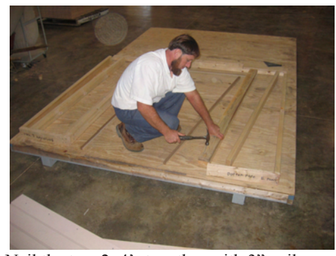
Nail the two 2x4's together with 3" nails as shown.