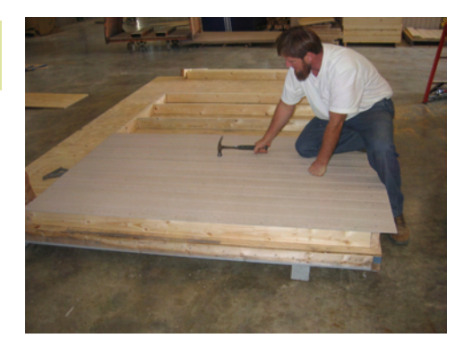
Fasten with 2" nails every 8".