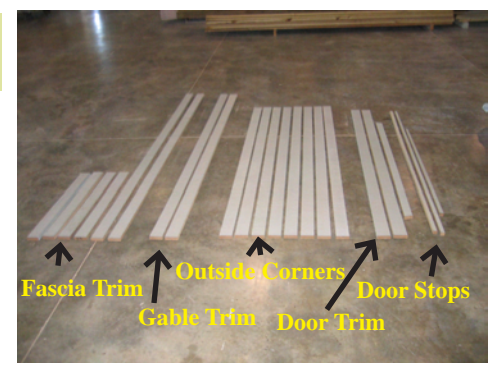
Locate and review your trim list and identify all construction materials.