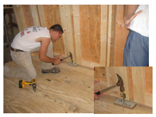
Use the hammer and tap on top of barrel bolt so you can locate where to drill the hole for the barrel bolt.