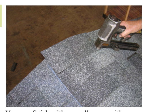
You can finish with a smaller cap with no adhesion strip.