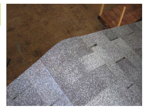
The roof is now complete.

Again, thank you for purchasing from Little Cottage Co. We hope you enjoy your building for years to come!