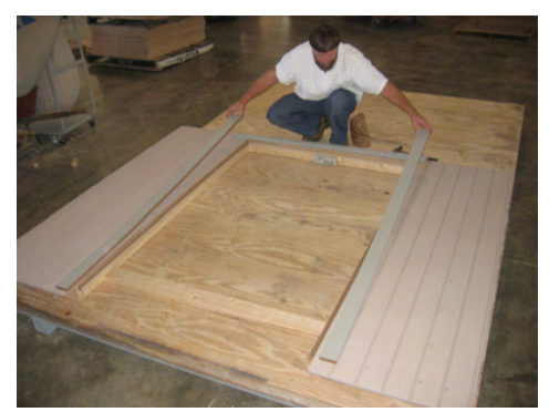
Locate 2 3/4" door trim as shown.