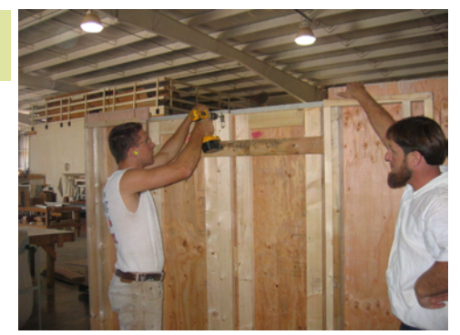
The wall is upside down, as shown. Fasten barrel bolt on the bottom as shown.