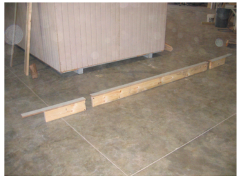
Next install 2 3/4" trim as shown on the top of the 2x6.