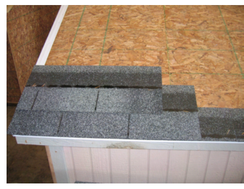
Continue installing shingles in a staggered fashion.