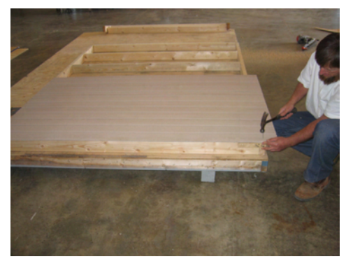
Next fasten bottom as shown. Fasten with 2" nails.