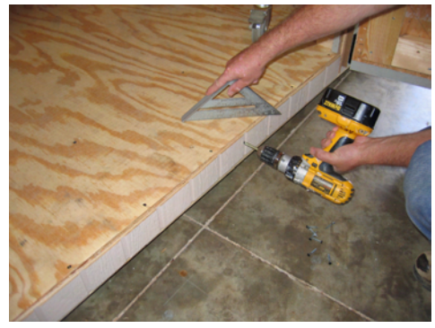
Install the siding strip beneath the door. Be sure to keep even with the floor as shown with the square.