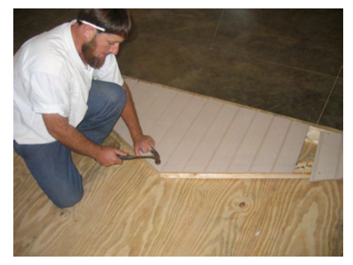
To fasten start at the peak and fasten with 2" nails, keep siding flush with 2x4 on top as shown.