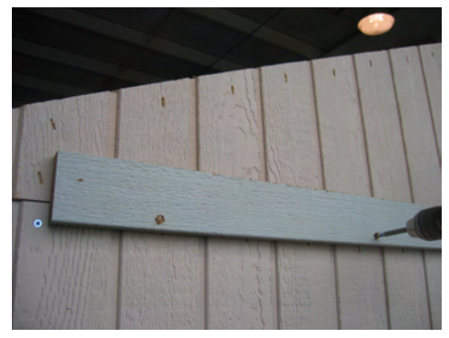
Fasten the trim into the bottom wall as shown with 2" nails. This will also help to make it sturdy.