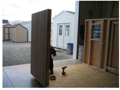
Continue installing panels per diagram.