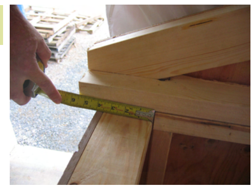
Measure in 5 1/2" From the edge.