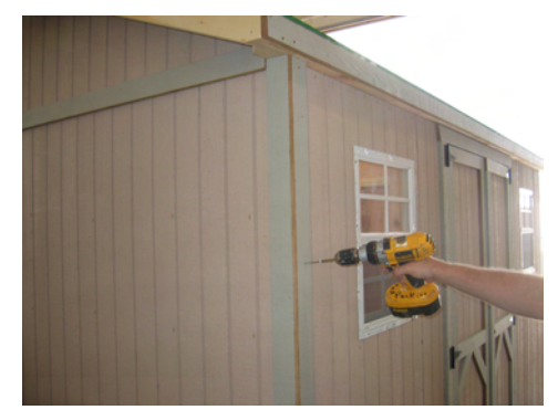
Install the outside corner trim. Use screws roughly 12" apart on either side.