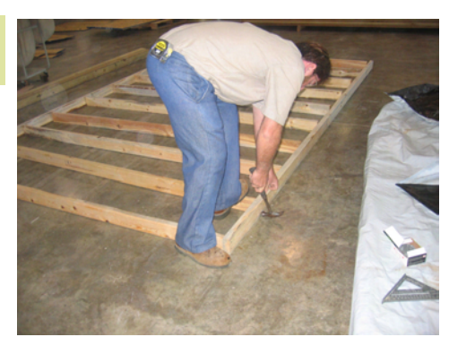
Continue fastening the floor with 3" nails as shown.