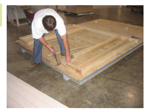
Continue with 3" nails as shown.