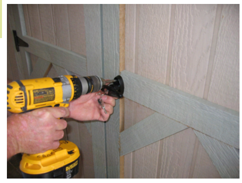
Install the door latch in predrilled hole.