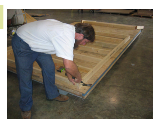
Fasten the wall with 3" nails as shown.