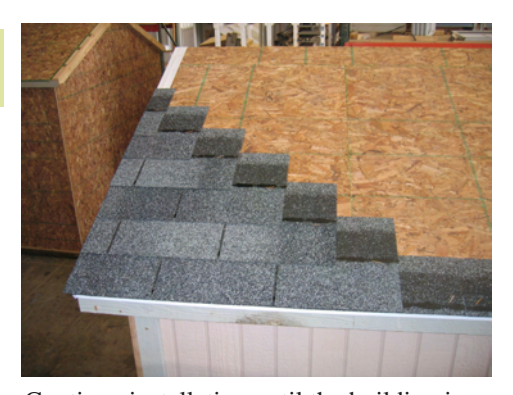
Continue installation until the building is finished.