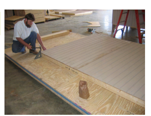
Make sure that you always fasten the top first and keep flush with 2x4 top plate.