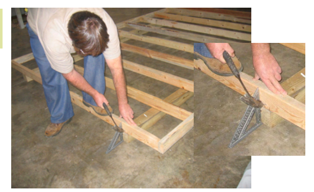
Use your square and make sure 2x4 and 4x4 are flush and fasten with 3" nails on all four points.