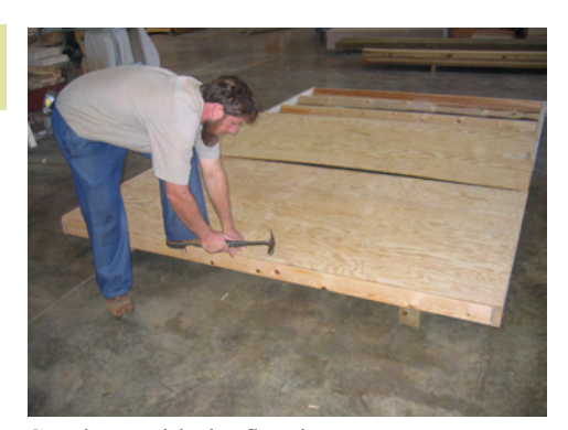
Continue with the flooring.