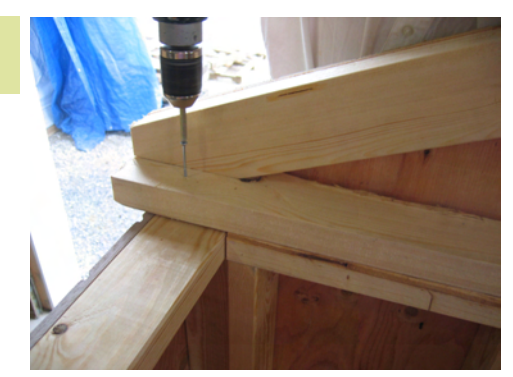
Once you have this positioned fasten, with 3" nails. Repeat this on the other side. If you can not obtain a 5 1/2" reading on either side, split the difference between the two.