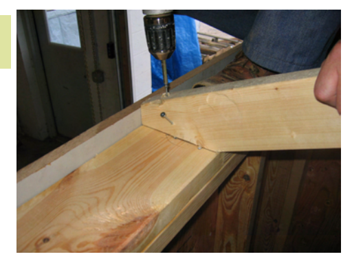
Install the truss as shown. The trusses for the larger building will need to be assembled.