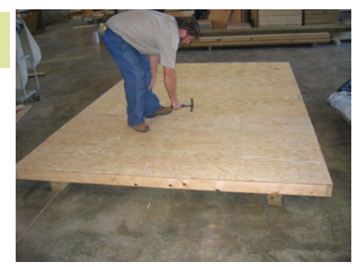
Fasten every 6" to 8"with 2" nails.