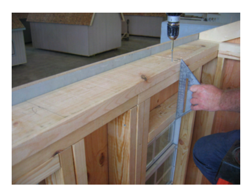
Install the next piece of 2x6 and fasten with 3" nails.