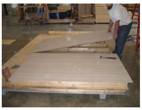
Continue installing Smartside siding.