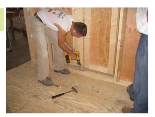
Next drill the hole for the barrel bolt.