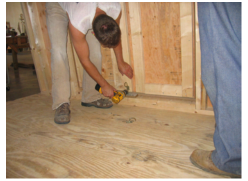
Install the barrel bolts as shown and fasten with 1 1/4" black head screws.