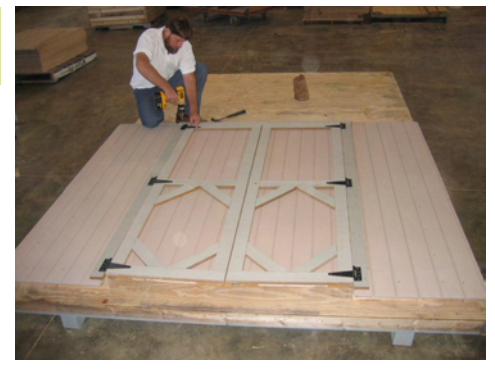
Make sure reveals on all sides are the same and fasten with 2 1/4" black headed screws.