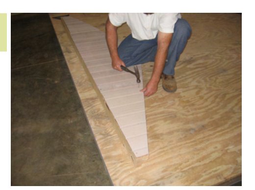
Nail the Smartside every 6" to 8".