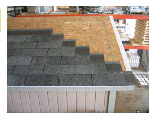
Continue over the edge of the building.