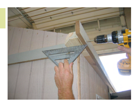
Install the small rake block as shown.