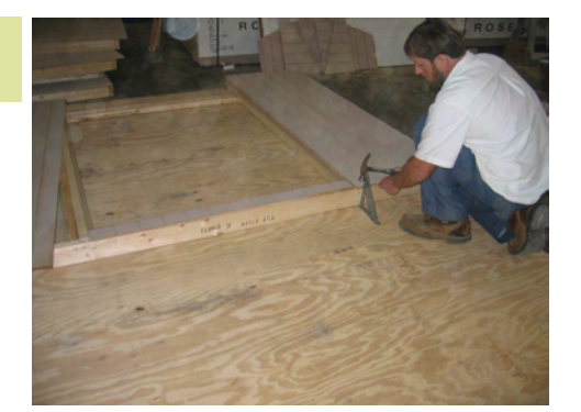
Install Smartside siding as shown per diagram and fasten with 2" nails.