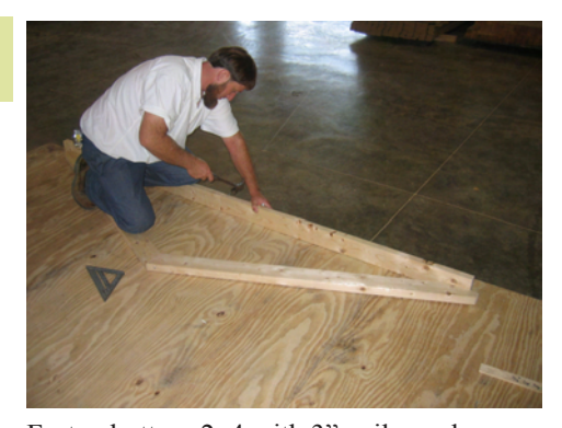
Fasten bottom 2x4 with 3" nails as shown.