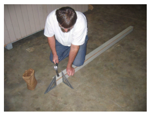
Make an L-corner as shown. and fasten with 3" nails.