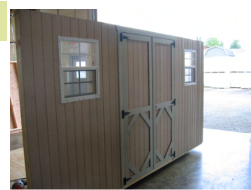
Install the next panel. In larger buildings you will probably have more panels. Refer to the diagram for the order of installation.