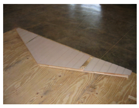
Next install the Smartside siding as shown.