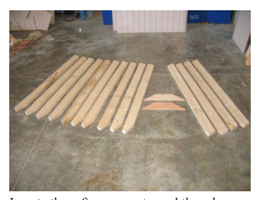
Locate the rafters, gussets, and the rakes.