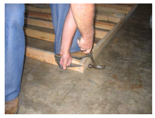
Start at the corner and use the square to make sure the corner is flush and fasten with 3" nails.