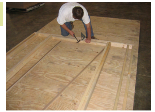
Fasten 48" header with 3" nails.