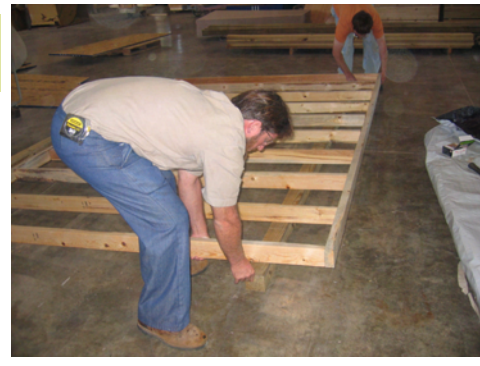
Place 4x4's where marked 13" as shown.