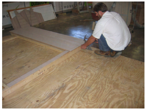
Continue installing Smartside and always fasten the top first to keep flush with top plate.