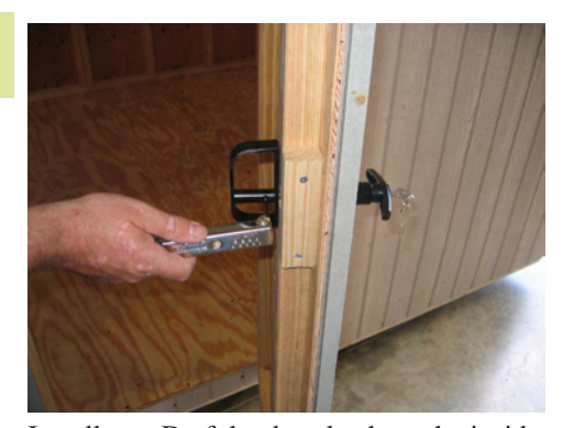
Install part D of the door latch on the inside.