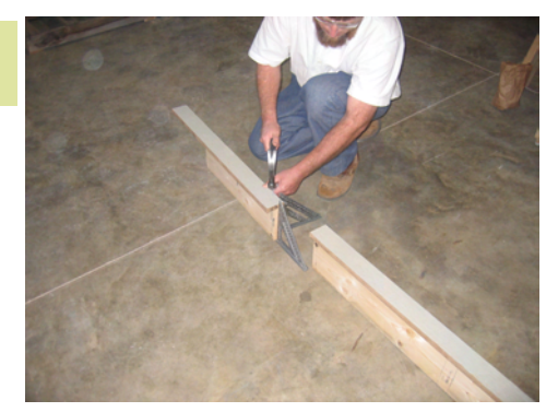
Use the square and make sure it is flush on the end and bottom side as shown and fasten with 2" nails.