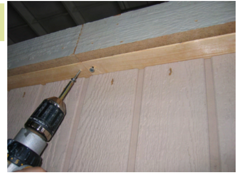
Fasten the trusses from the outside underneath the 2x6 and into the truss. Use one 3" nail on either side of the splice if the truss rests on the splice.