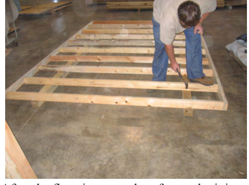
After the floor is squared up fasten the joist with 3" nails into 4x4's.