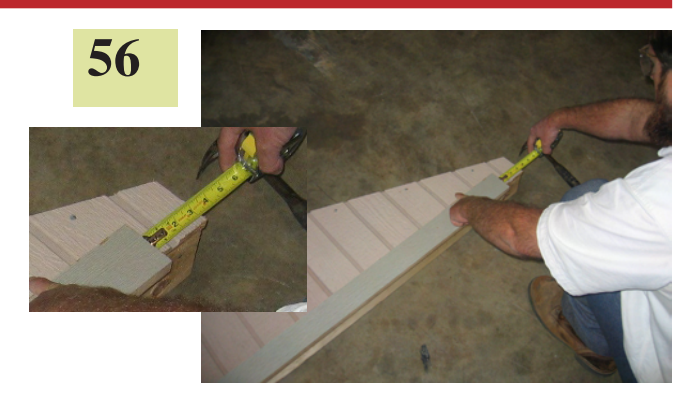
To fasten measure 3 1/2" in from the end and fasten with 2" nails.