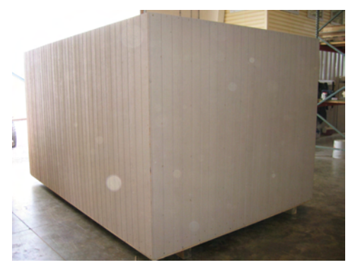
Continue installing panels per diagram.