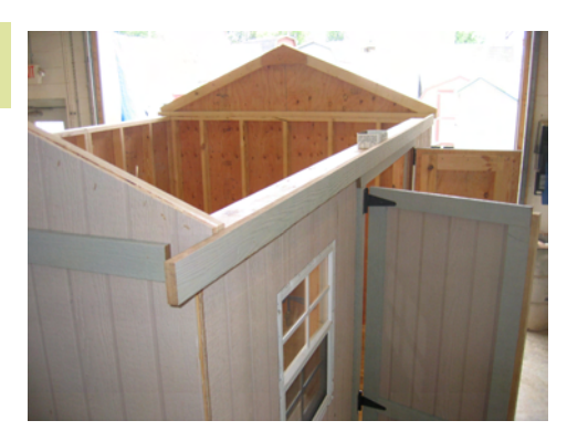
This shows one side completed.