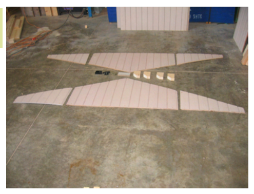
Locate gable parts as shown.