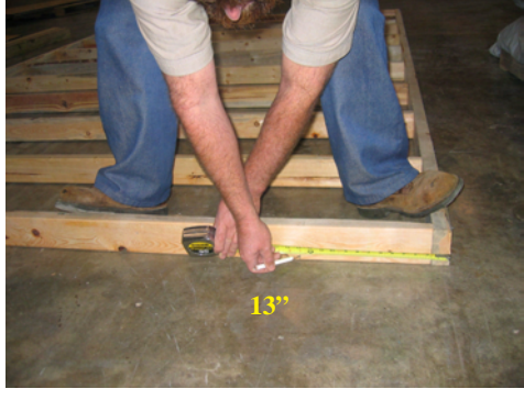
Measure 13" as shown, to place 4x4 runners on all four corners, on 8' wide buildings. On 10' and 12' wide buildings, the 4x4's are placed on the outside and centered in the middle per the diagram.