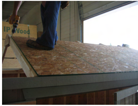
Continue fastening to the trusses. make sure the trusses are 24" O.C.