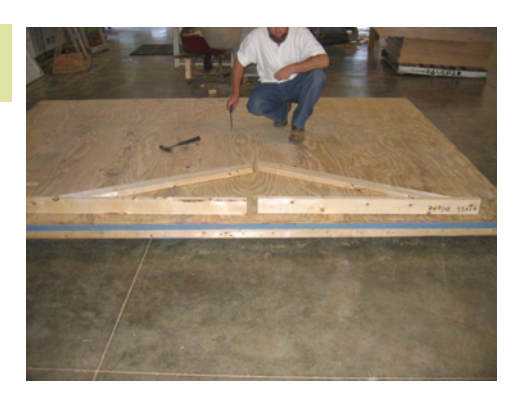
Locate 2x4's for gable as shown.