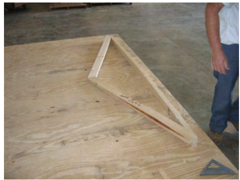
This is what the gable looks like when framed.