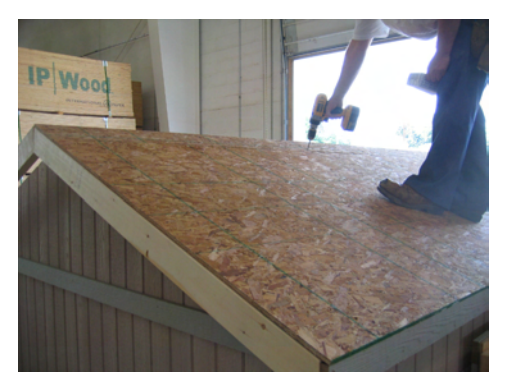
Fasten on top.