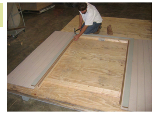
Fasten the door trim with 2" nails every 8".