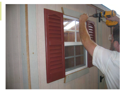
Install the trim above and below the shutters.