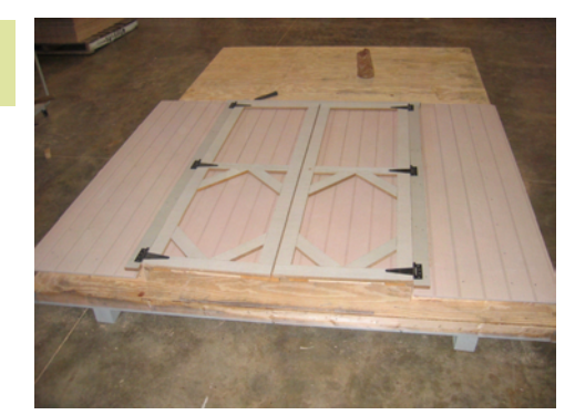
Install the doors as shown.