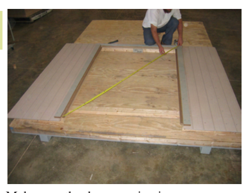
Make sure the door opening is square.