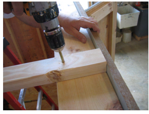
You may need to pull or push the wall in order to obtain the correct positioning before fastening.