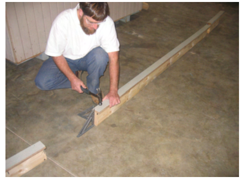
Continue with the same pattern as the previous picture.