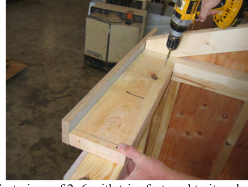
Install the first piece of 2x6 with trim fastened to it and fasten with 3" nail. Keep trim face up as shown. Match sets for each side of the building. Keep inside even as shown with square. Fasten into 2x4 top plate.