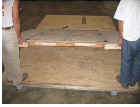
Set the wall up. pick it up from the bottom which is upside down, to install barrel bolts.