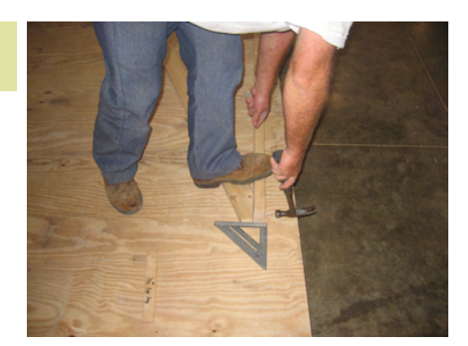
Make sure ends are flush before fastening.