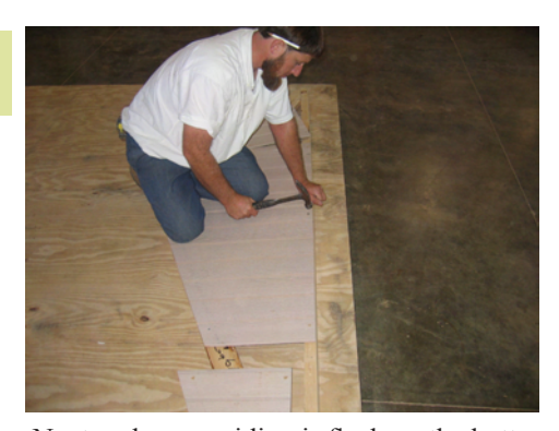
Next make sure siding is flush on the bottom side with 2x4 and fasten with 2" nails as shown.