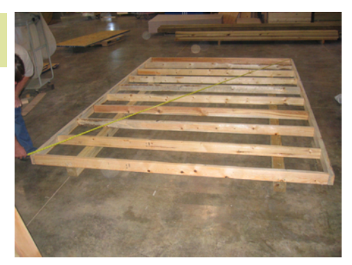
Next square up the floor as shown.