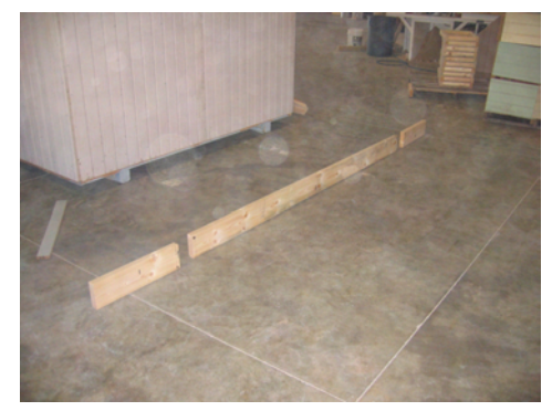
Locate the 2x6 for the top plate as shown.