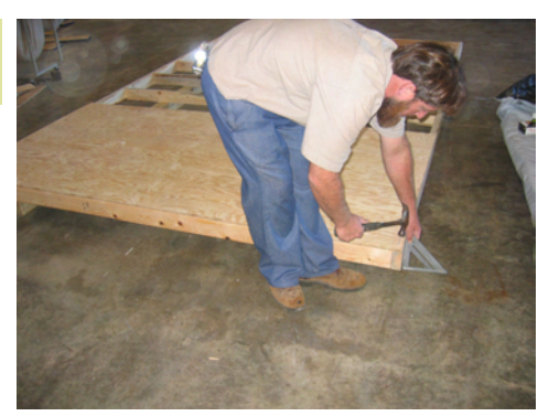
Make sure the CDX is flush with the 2x4 and fasten with 2" nail.