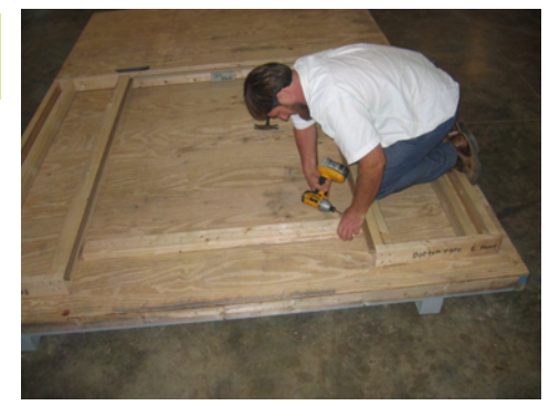
Temporally install the 2x4 in between the door opening to square the wall. Fasten with 2 1/2" screws.