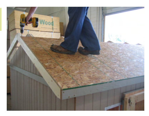
Continue OSB sheeting installation as shown.