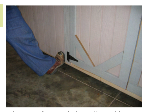
Using your foot, push the wall panel in, so the siding is against the floor.