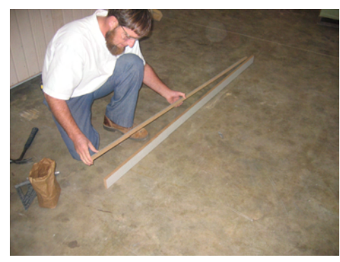
Next locate the corner trim which is 2 3/4" wide x 78" long.