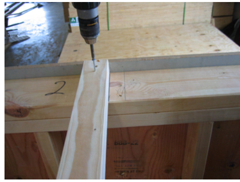
Install the wall brace. Position it beside the center truss marks. This will hold the building together and provide strength.