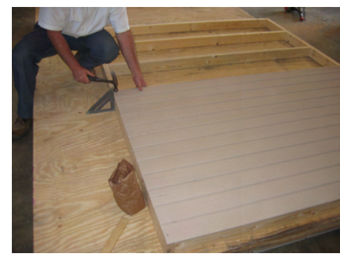
Fasten the top first as shown.