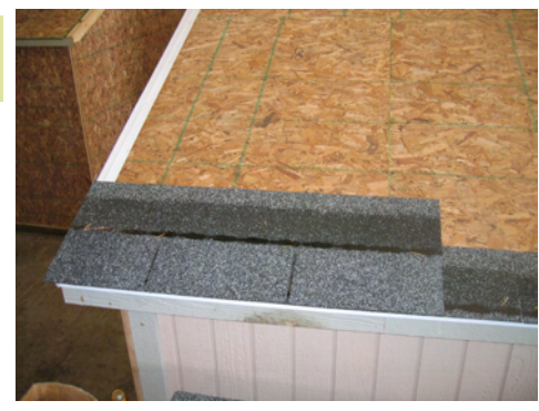
Start installing shingles.