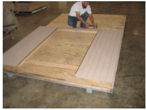
Install small strip on header as shown.