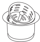
Deep Basket Disposal Flange [RVA1049ST]