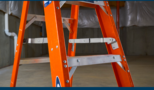
Heavy duty spreaders and knee braces on every step for maximum durability