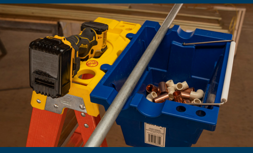
LOCKTOP<sup>™</sup> ladder top safely holds I6 tools & is LOCK-IN<sup>™</sup> accessory compatible

EDGE360<sup>™</sup> Bracing designed for drop protection, stability and slip resistance