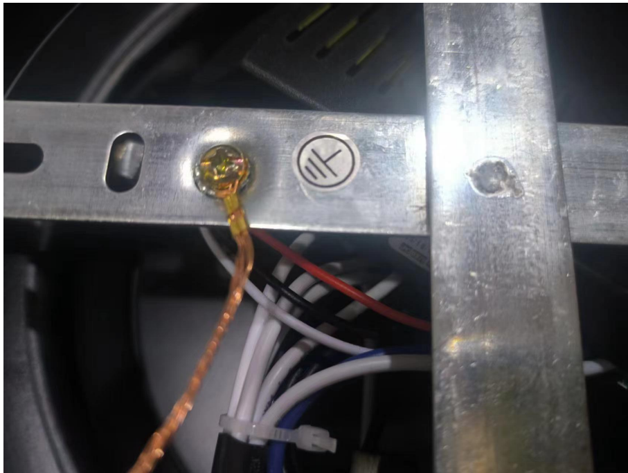
Fig. 3 - Overview for model TWIN01