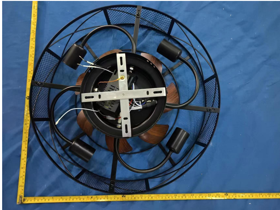
Fig. 1 - Overview for model TWIN01