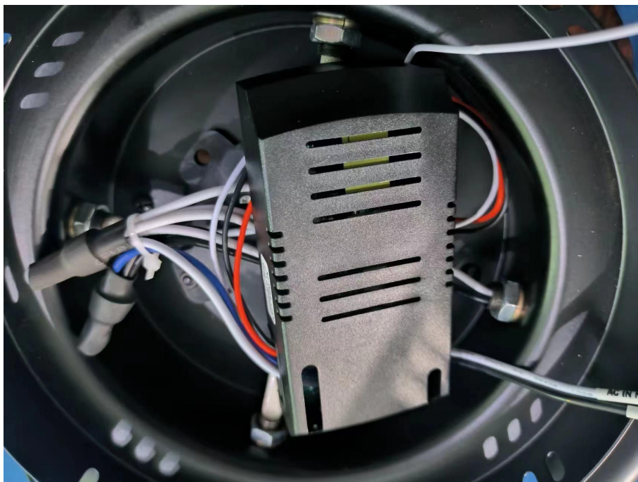
Fig.4 - Overview for model TWIN01