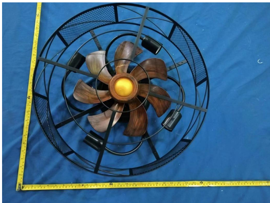
Fig. 2 - Overview for model TWIN01