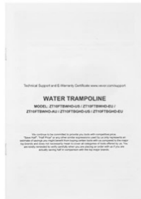
Instruction Manual x1