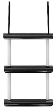
3-Step Ladder x1