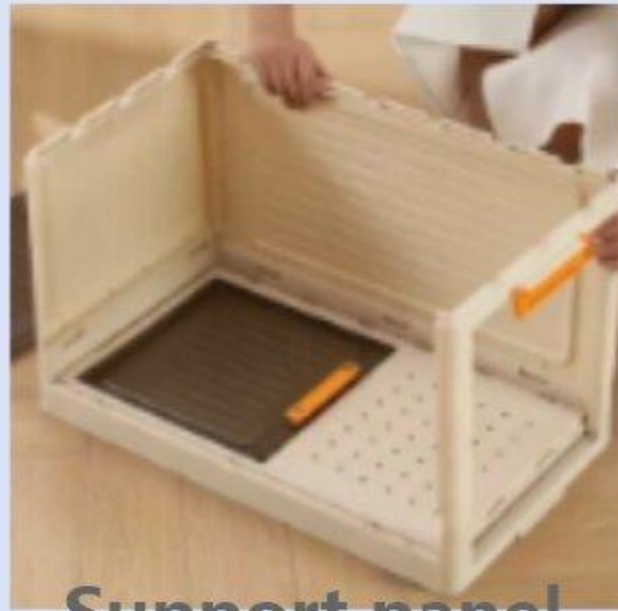
Support panel installation