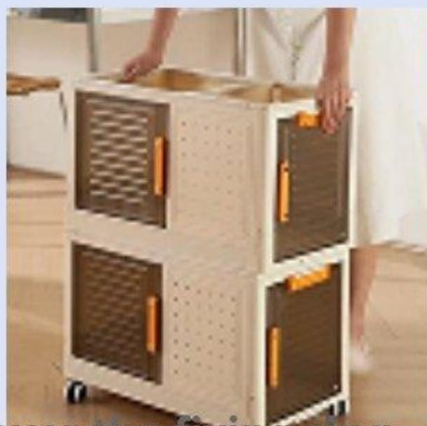
over the fixing ring fasten the second layer