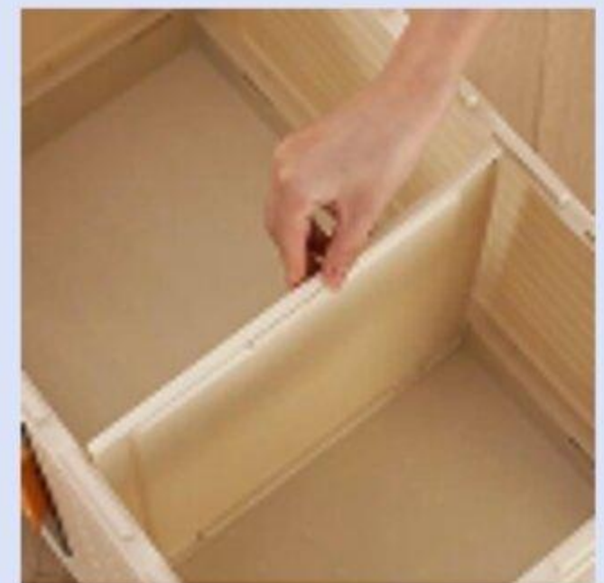
Lift up the partition