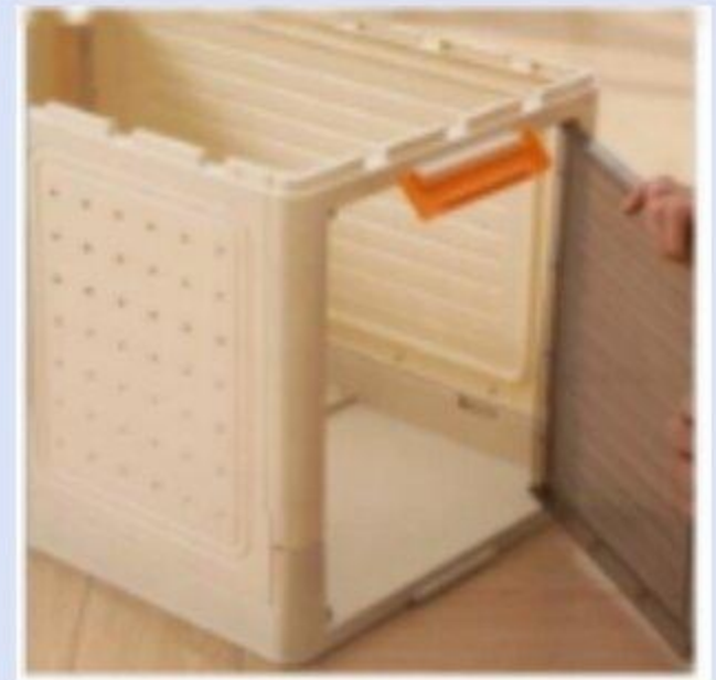
Open the side door