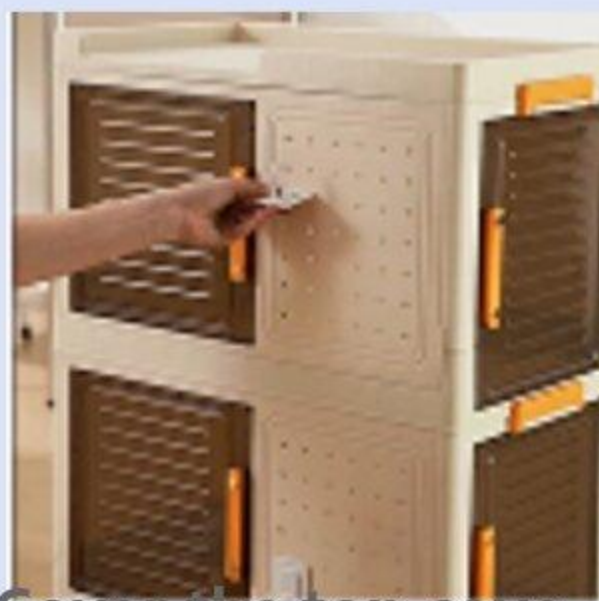
Cover the top cover and place the hook