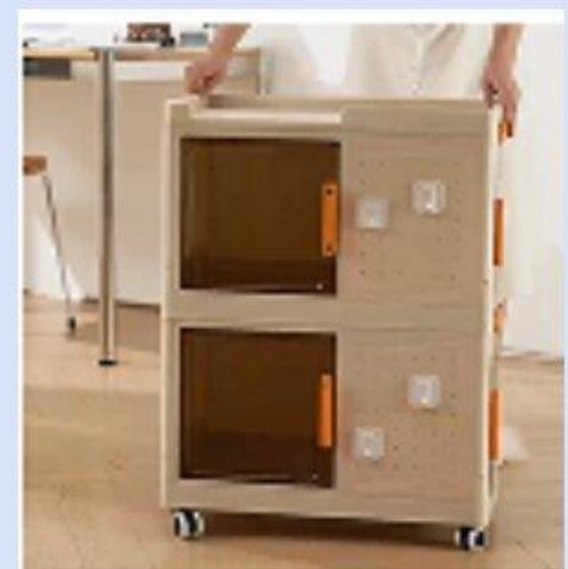
installation is complete