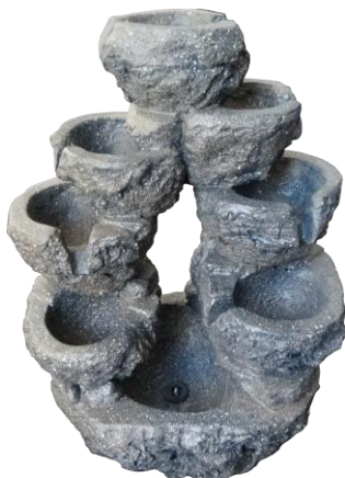
Fountain (Pump & LED lights pre-installed) 1x