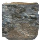
Fountain Back Door 1x