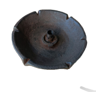
E. Medium Bowl