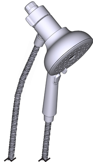
Nebia by Moen™ Quattro Handshower with Cradle and Hose