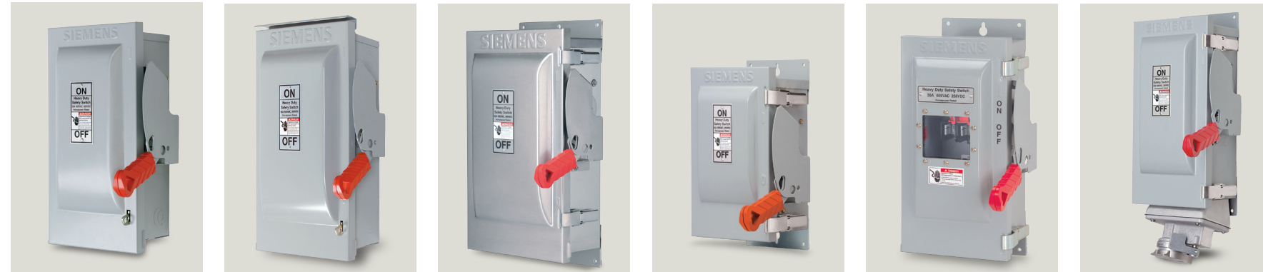
Type 1 Type 3R Type 4X Type 3R / 3S / 12 / 13 Safety Switch with Window Crouse Receptacle Switch

Published by Siemens Industry, Inc. 2020. Siemens Industry, Inc. 5400 Triangle Parkway Norcross, GA 30092