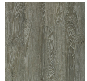
208LF651 Westfield Oak Shadow Gray