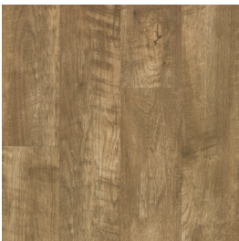
202LF651 Topsfield Oak Barnwood Blend