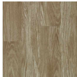
207LF651 Oxford Oak Warm Nutmeg