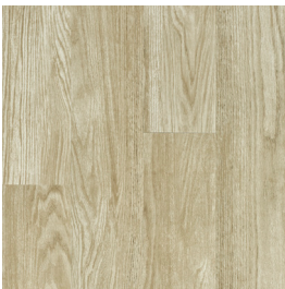
201LF651 Oxford Oak Sand Dune