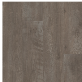
2514525 Topsfield Oak Rustic Blend