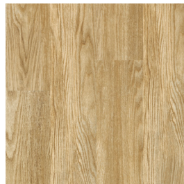
203LF651 Oxford Oak Honeycomb