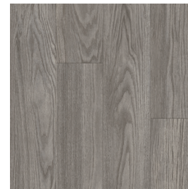
2514524 Oxford Oak Heather Gray