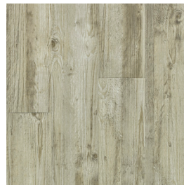
205LF651 Paxton Oak Distressed Driftwood