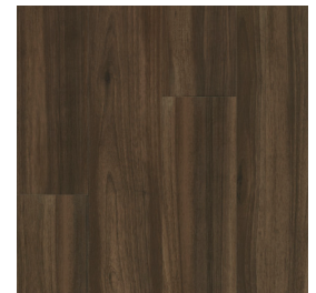
204LF651 Chesterfield Walnut Double Espresso