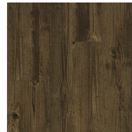
206LF651 Paxton Oak Mudslide