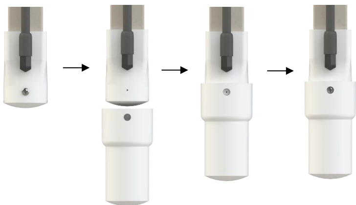
Figure 3: Ballast Installation

1. Remove screw from center section, slide ballast tube onto bottom of diffuser section with a slight back and forth twisting motion until the small hole on diffuser section is in the center of the large hole in ballast tube. Insert screw and tighten until screw head is flush.