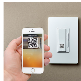
4) Connect to the App