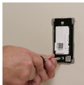
3) Install Smart Switch