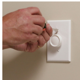
1) Turn off breaker