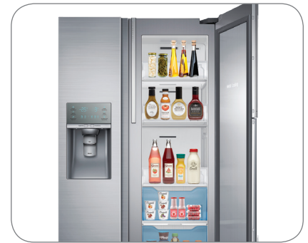
Food ShowCase Fridge Door