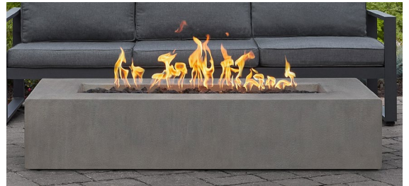
Available in flint (143NG-FLNT)