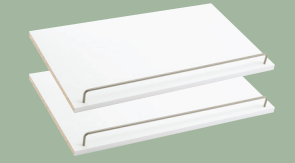
Model# 5444 Shoe Shelf Kit