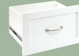
Model# 5446 10 in. Deep Drawer For Narrow Tower