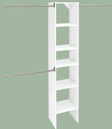
Model# 5441 4-9 ft. Narrow Tower Kit