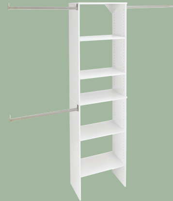
Model# 5442 5-10 ft. Wide Tower Kit