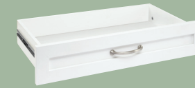
Model# 5447 5 in. Deep Drawer For Wide Tower