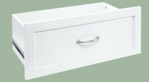
Model# 5448 10 in. Deep Drawer For Wide Tower