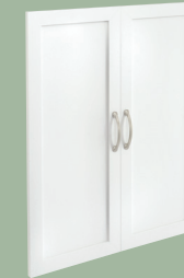
Model# 5449 Door Kit