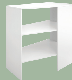
Model# 5443 Stackable Corner Unit