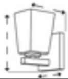
Image File Name: P5042-647B.jpg