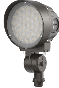
5X5 (50°) Flood