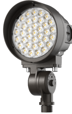
2X2 (20°) Spot