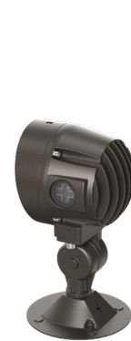
Round Mounting Plate