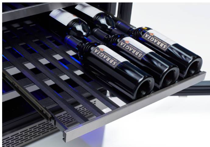
Full-Extension Wood Racks