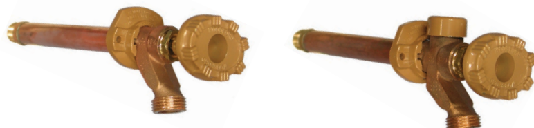
Model 16 No anti-siphon protection.