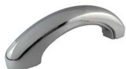
Standard Grab Bar