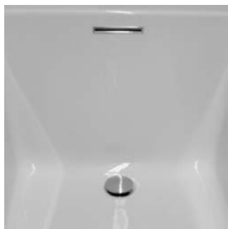
Linear Integral Waste and Overflow