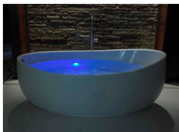
Chromotherapy-LED Lighting System