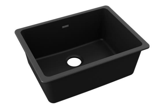
Grevstone Matte Black (MB)

A Century of Tradition and Quality. For more than 100 years, Elkay has been making innovative products and providing exceptional customer care. We take pride in offering plumbing products that make life easier, inspire change and leave the world a better place