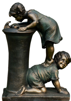
Fountain (LED lights pre-installed) 1x