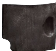
Fountain Back Door 1x