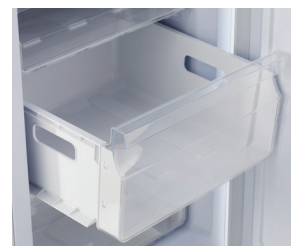
Multiple storage drawers for easy access