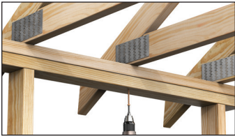
DOUBLE TOP PLATE TO TRUSS+RAFTER