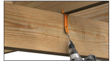
BEAM TO JOIST