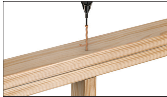
DOUBLE TOP PLATE TO STUD