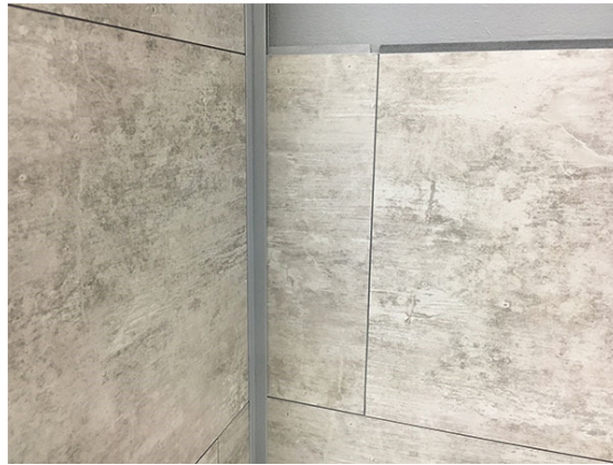
Interlocking joints at tile's right and bottom are tight.

Use a damp rag or paper towel to clean off any sealant or adhesive that may have been squeezed onto the tile surface.