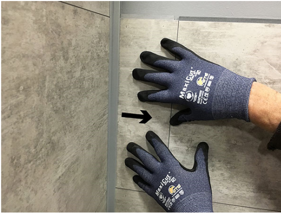
Pull tile into interlocking joints.