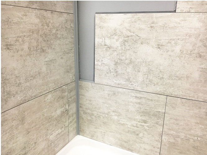
Short tile piece needed to finish row on an inside corner

If you are using corner and/or L-trims for a DumaWall shower kit installation, this guide will show how to install the last, short tile at the end of a row. Read and follow this guide if your project looks like this: