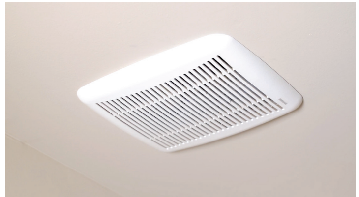
Top: installation process - mudded base piece of the Drywall Pro X Bottom: "before" view of cumbersome traditional exhaust fan cover