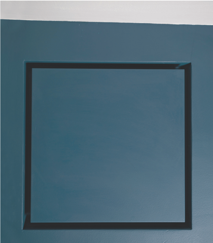
Above: bottom view of painted finish, installed Drywall Pro X. Center piece can be removed to access ventilation motor