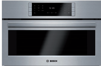
HSLP451UC Stainless Steel

The only steam convection oven in its class installs flush, for a European kitchen design.