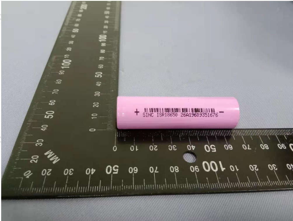
Figure 3 Overall view I of cell (电芯图I)