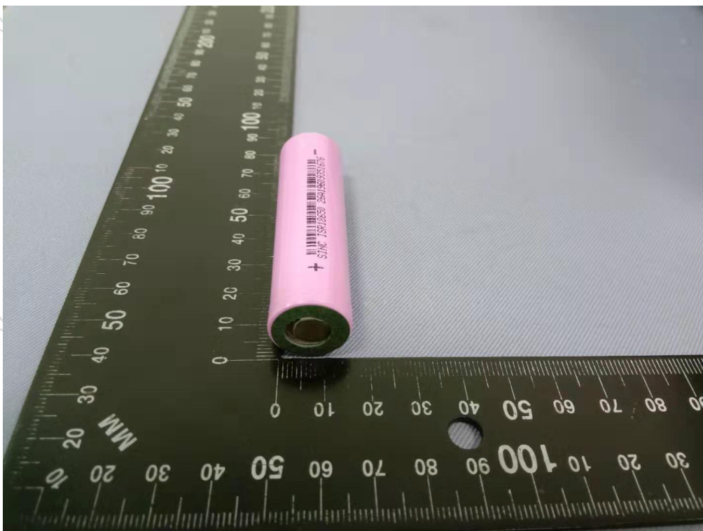
Figure 4 Overall view II of cell (电芯图II)