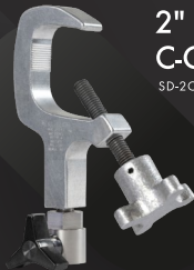
2" HEAVY-DUTY C-CLAMP SD-2CS-G1

Visit SeeDevil.com for a comprehensive list