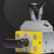
MAGNETIC MOUNT SD-MGS600-SM-KIT