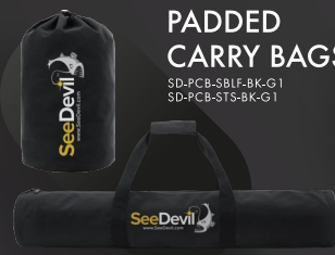
PADDED CARRY BAGS SD-PCB-SBLF-BK-G1 SD-PCB-ST5-BK-G1