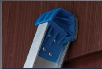
Traction Cap™ endcaps