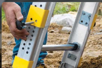
Adjusts in 3/8in increments