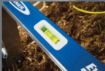
Integrated bubble level