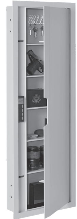
Item No. 75414