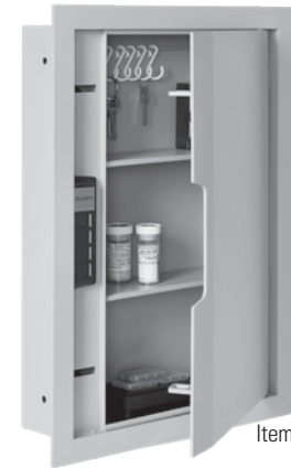
Item No. 75413