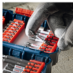
Best Case for the Best Bits

This innovative bit system allows you to customize configurations, providing flexibility, efficiency and quick access. Take only the bits needed for a job, instead of the whole tackle box.